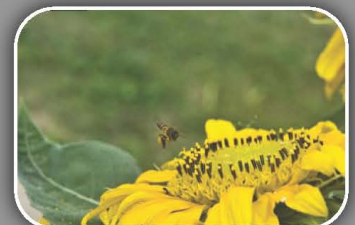
Busy Bee, far north-east Singapore