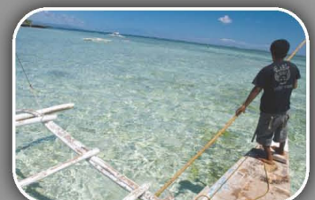
Island Sailing, Cebu Philippines