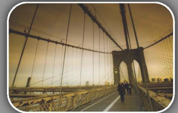
Brooklyn Bridge, NYC